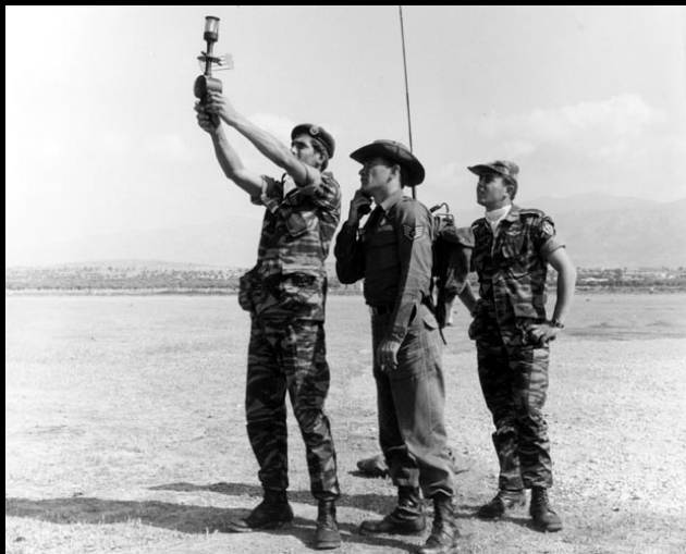
7th ACS Combat Controllers