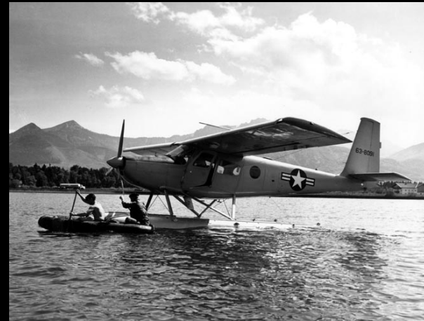
Super Helio Courier aircraft 63-8091. One of two U-10s the 7th ACS flew and the only one with floats.