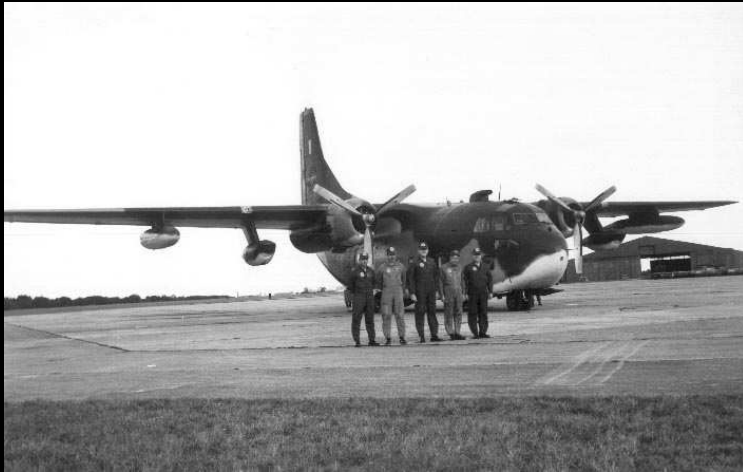
The 7th ACS was equipped with four C-123s from 1964 to 1968.