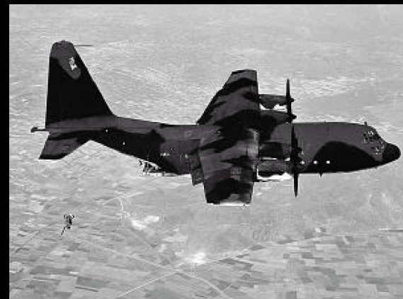
7th SOS HALO drop from aircraft 64-0572.