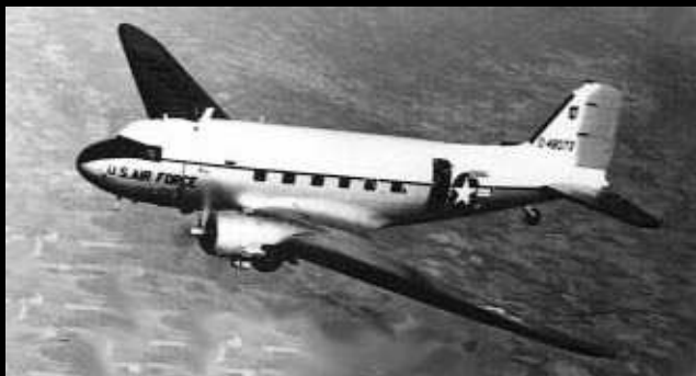
C-47 aircraft 43-48273