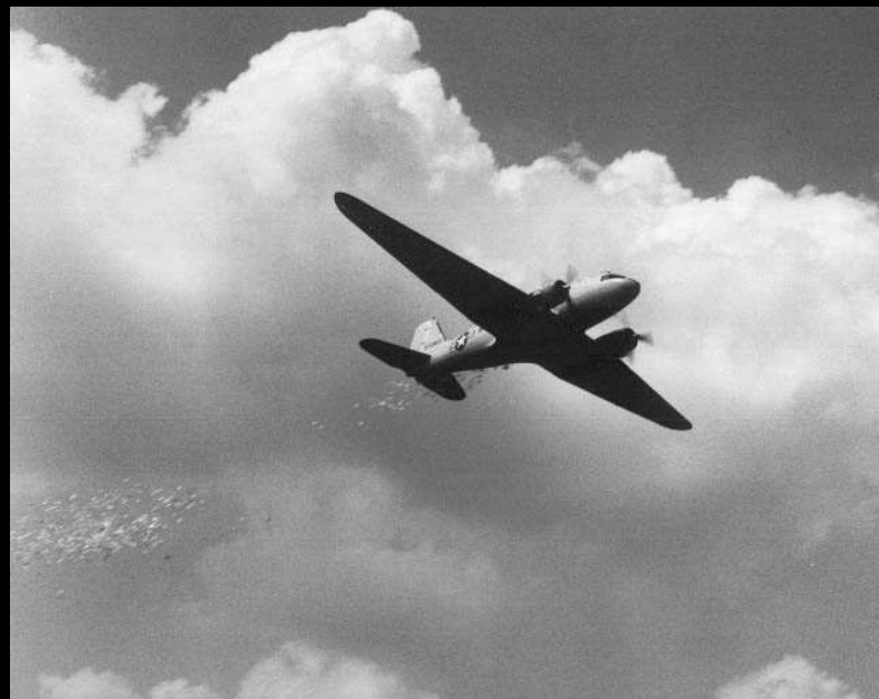
The 7th SOS had six C-47s assigned in 1964. One aircraft was lost in 1969.