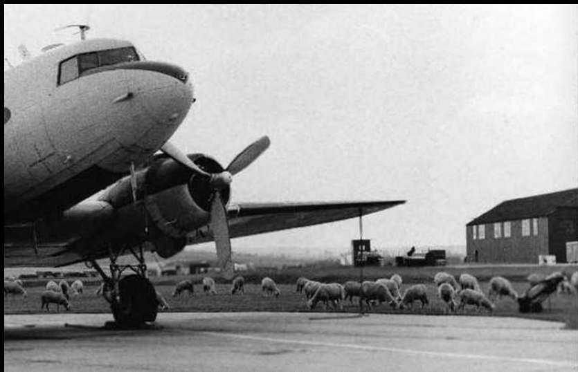
7th ACS C-47 at Sembach AB, Germany