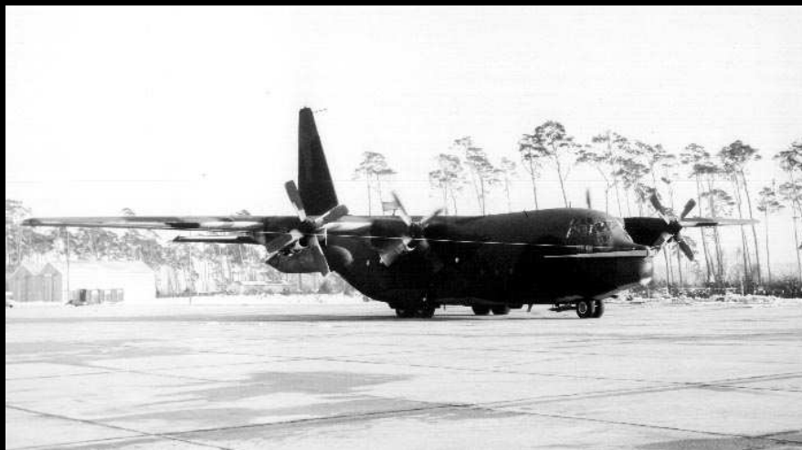
Combat Arrow aircraft 64-0551 on the ramp at Ramstein AB, Germany, circa 1968. This was the first C-130E(I) assigned to the 7th SOS.