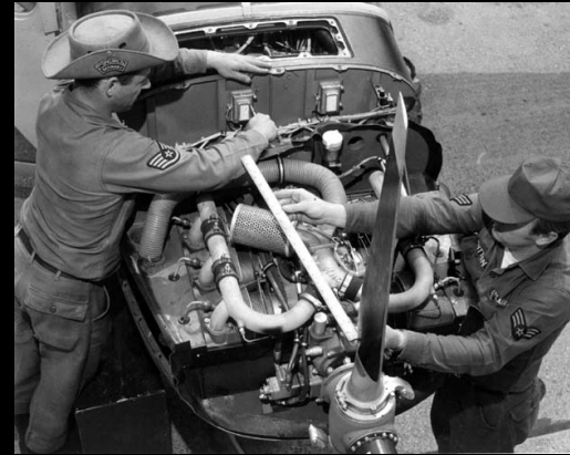
7th ACS Maintenance work on U-10 engine.