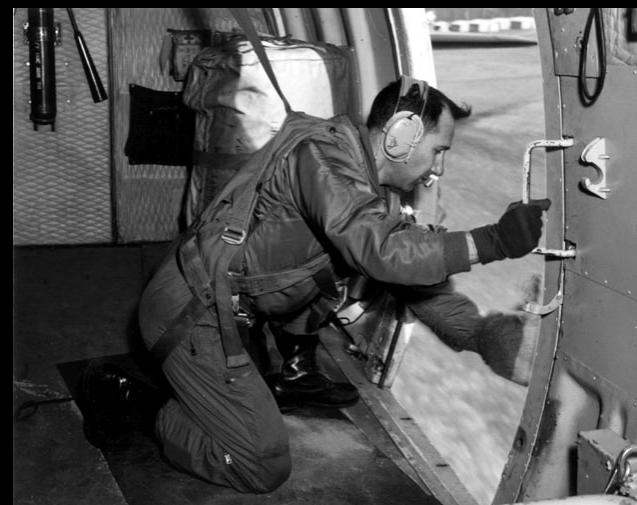
7th ACS Loadmasters