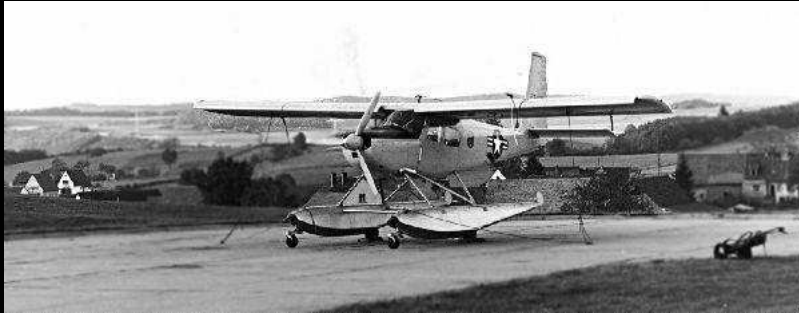
7th ACS U-10 at Sembach AB, Germany