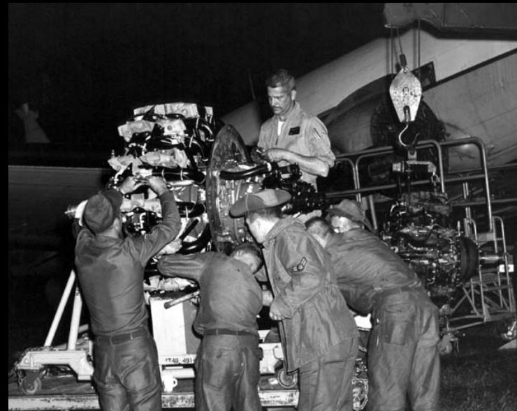
7th ACS Flight Engineer and Maintenance work on a C-47 engine.