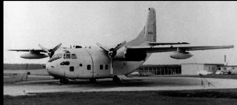
7th ACS C-123 at Sembach AB, Germany.