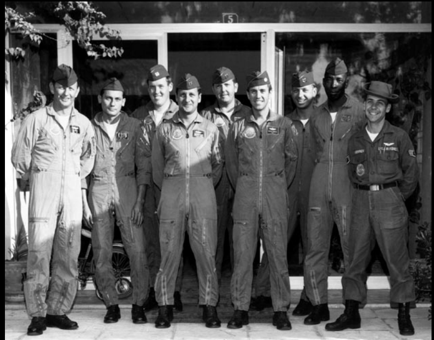
7th SOS Son Tay Raid crewmembers