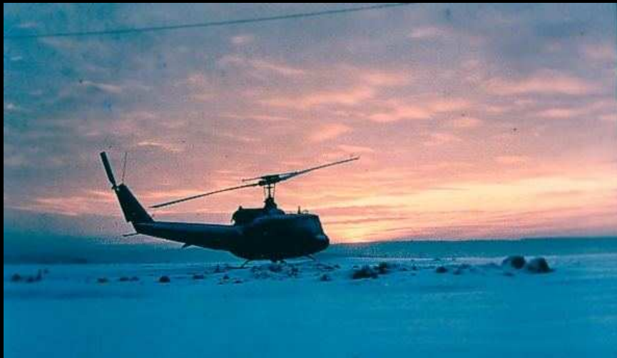
7th SOS UH-1 at Sembach AB, Germany.